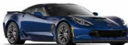
NEW Admiral Blue Metallic