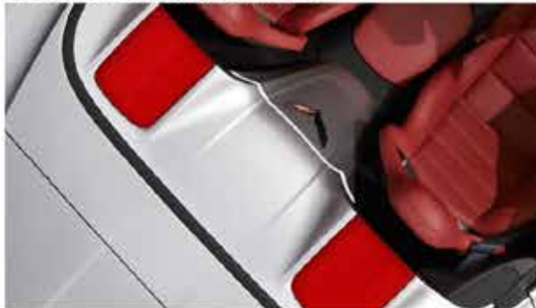
Torch Red Corvette Tonneau Lid Trim Insert (SMN)