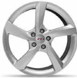
5-spoke Silver-Painted 19-inch Front/20-inch Rear Wheel (5YV)