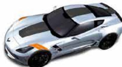
Arctic White, Volcano Orange, Carbon Flash