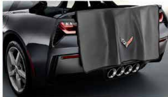
Rear Fascia and Spoiler Protector (VTB)