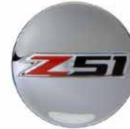
Corvette Chrome w/ Z51 Logo (VWD)