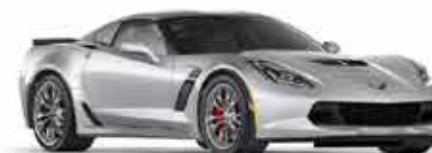
Blade Silver Metallic