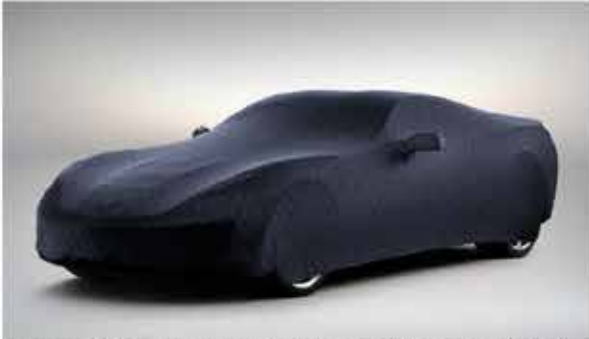
Embossed Stingray Logo Pattern Indoor Dust Cover, Black (RWH)