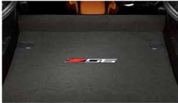
Z06 Logo Black Cargo Mat (VLI)