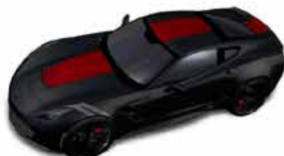
Black, Shark Gray, Red

Customers can personalize their Grand Sport in a number of different ways. Color combinations are not limited to the options called out below.