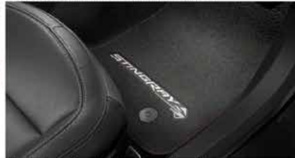
Black Stingray Premium Front Carpet Floor Mats (w/Red Stitching and Stingray Logo) (VYW)