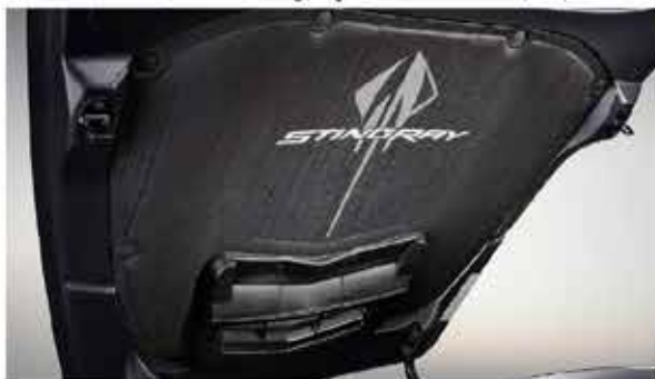
Underhood Liner, Stingray Logo on a Black Field (VTE)