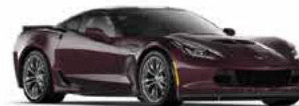
NEW Black Rose Metallic*