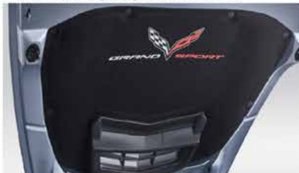
Underhood Liner, Grand Sport Logo (VTE)