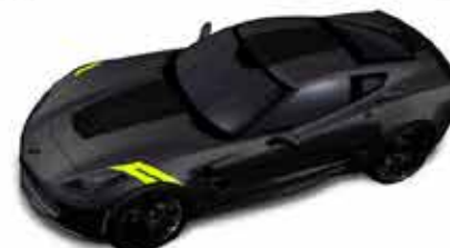
Watkins Glen Gray, Hyper Green, Carbon Flash