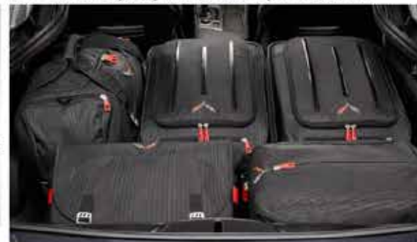
Five-Piece Luggage Set (S2L)