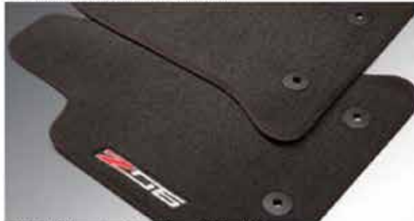
Black Z06 Premium Front Carpet Floor Mats (w/Red Stitching and Z06 Logo) (VYW)