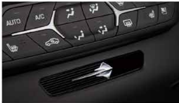
Black Interior Trim Badge with Stingray Logo (SM2)