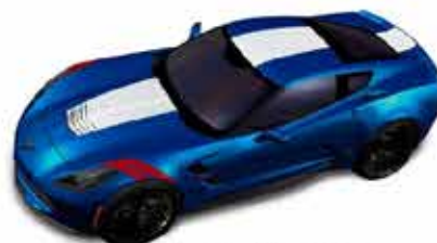
Admiral Blue, Torch Red, White