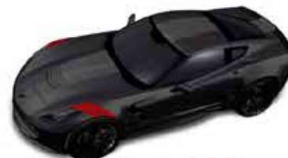
Watkins Glen Gray, Torch Red, Gray