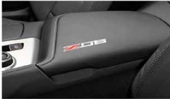
Z06 Logo Console Lid in Gray (SM8)