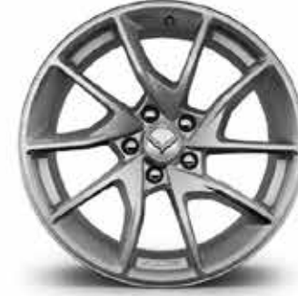
Z06 Nickel Pearl-Painted 19-inch Front/20-inch Rear Wheel (5Z8)