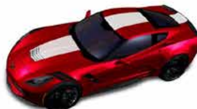
Torch Red, Carbon Flash, White