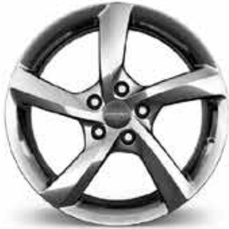
5-spoke Chrome 19-inch Front/20-inch Rear Wheel (5YU)