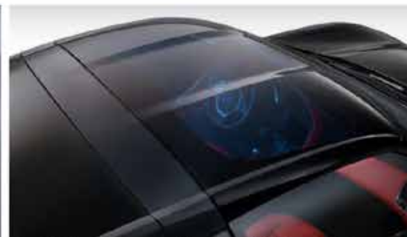
Corvette Coupe Transparent Removable Roof Panel (SBT)