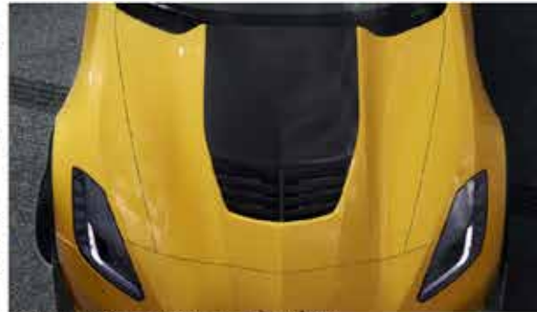
Black Hood Stinger Stripe Package (SFA)