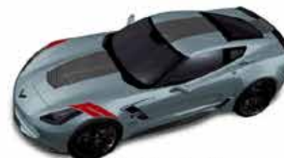
Sterling Blue, Torch Red, Gray