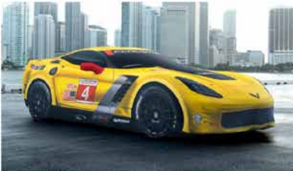
Corvette C7.R Racing Indoor Cover (WKU)