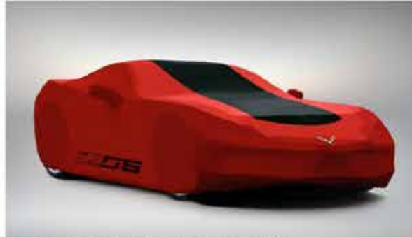
Red Z06 Logo Outdoor All-Weather Cover (VRB)