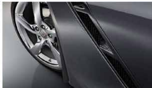
Corvette Splash Guards, Front and Rear Molded in Black (VQK)