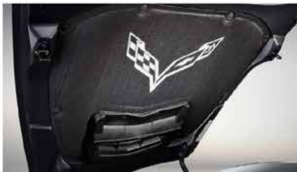
Underhood Liner, Crossed Flag Logo on a Black Field (VTE)