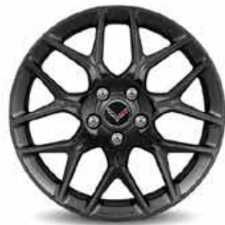
Painted Gloss Black 19-inch Front/20-inch Rear Wheel (5YX)