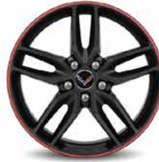
Satin Black Finish with Red Stripe 19-inch Front/20-inch Rear Wheel (5YZ)