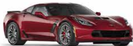
Long Beach Red Metallic Tintcoat*

Corvette Stingray, Grand Sport and Z06 offer the following exterior color choices.