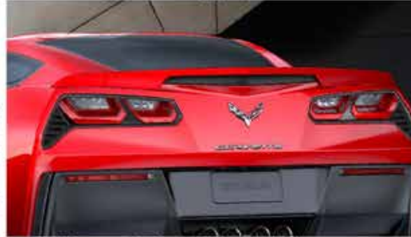
Torch Red Corvette Z51-Style Blade Spoiler (5ZU)