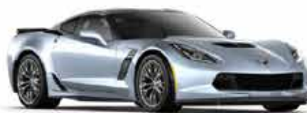
NEW Sterling Blue Metallic