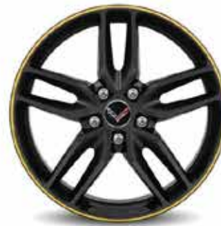
Satin Black Finish with Yellow Stripe 19-inch Front/20-inch Rear Wheel (5Z2)