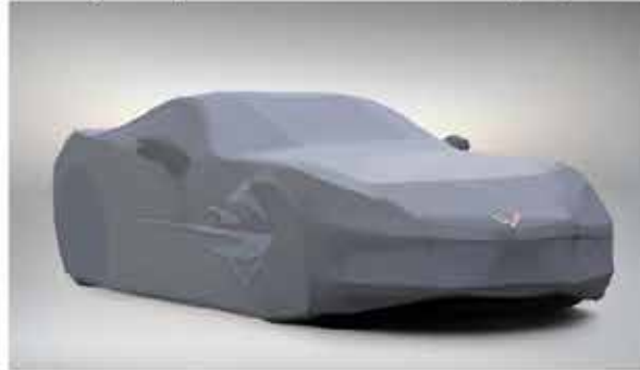
Gray Stingray Logo Outdoor All-Weather Cover (VRU)