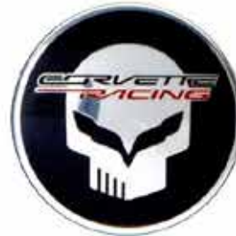
Corvette Jake Logo Center Cap (RXH)