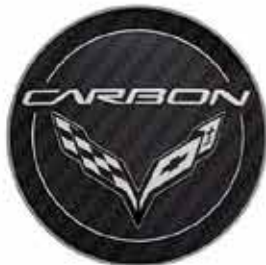
Corvette Carbon Logo (5ZG)