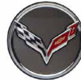
Corvette Crossed Flags Logo on Argent (5ZB)