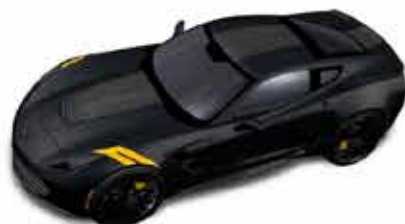
Black, Yellow, Gray