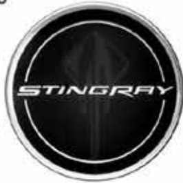
Stingray Logo Center Cap (RXJ)