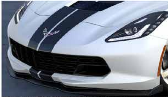
Z06 Grille Kit (RZB)/Carbon Flash Dual Racing Stripe Package (SB7)