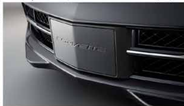
Corvette Front Aero Panel (5WH)