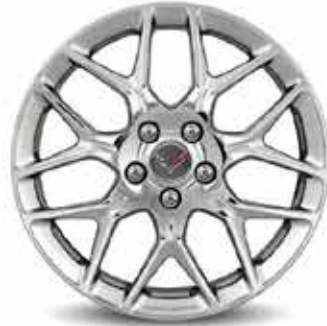
Polished Wheel 19-inch Front/20-inch Rear Wheel (5YW)