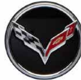
Corvette Crossed Flags Logo on Black (5ZC)