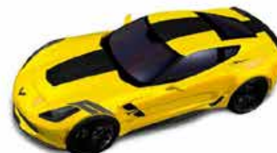
Racing Yellow, Shark Gray, Carbon Flash