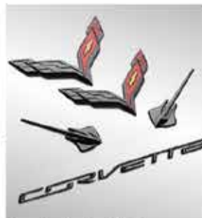
Corvette Carbon Flash Emblems (RIN)