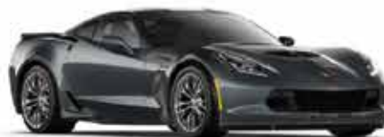
NEW Watkins Glen Gray Metallic