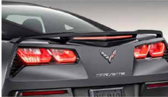
Black Corvette High Wing Spoiler (SB3)