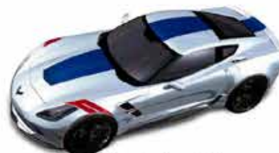
Arctic White, Torch Red, Blue