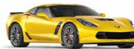
Corvette Racing Yellow Tintcoat*