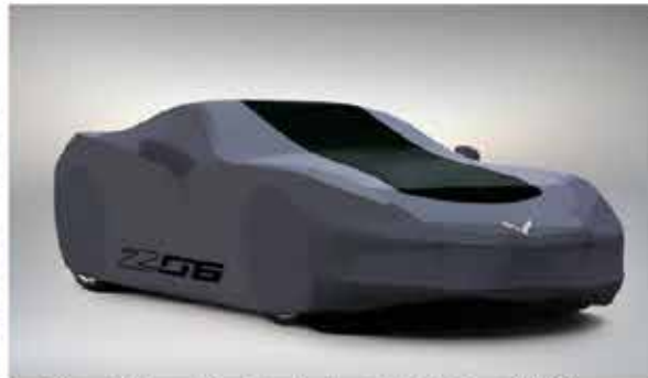
Cool Gray, Z06 Logo Premium Outdoor Vehicle Cover (VGS)