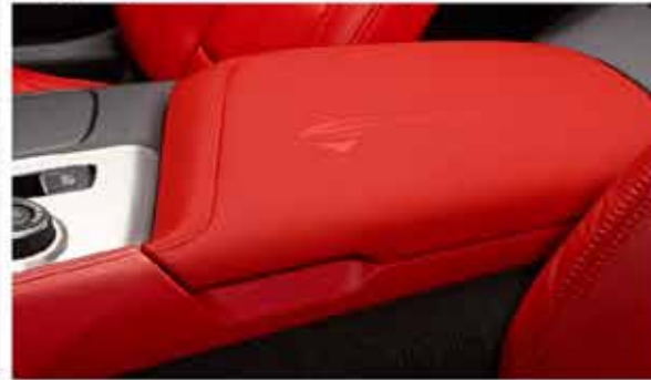
Leather Console with Stingray Logo in Red (VTF)