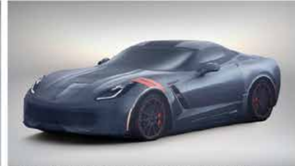
Embossed Grand Sport Logo Indoor Dust Cover, Blue (VRX)