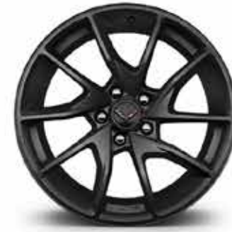
Z06 Black-Painted with Machined Groove 19-inch Front/20-inch Rear Wheel (6Z9)