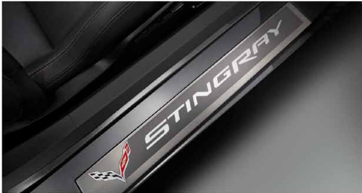
Door Sill Plates with Stingray Logo (V8X)