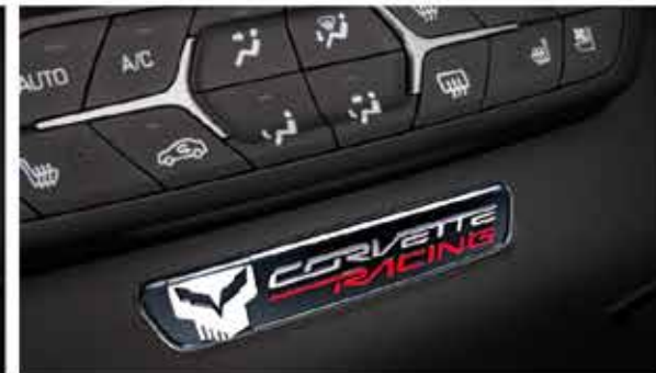
Jake Logo in Black (SM3)