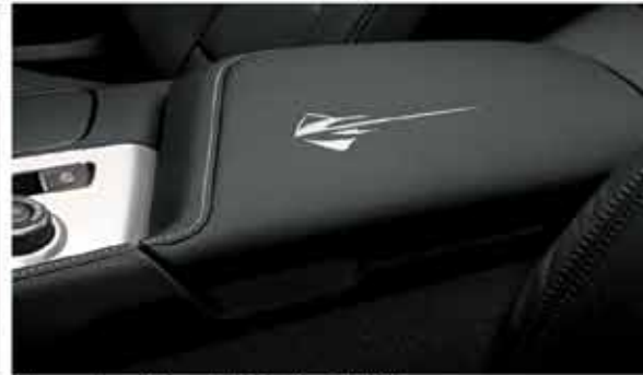
Stingray Logo Console Lid in Black (SH2)