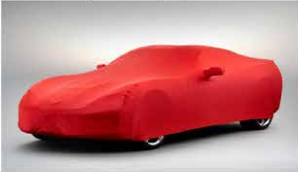
Red Embossed Crossed Flags Logo Pattern Indoor Dust Cover (WKQ)