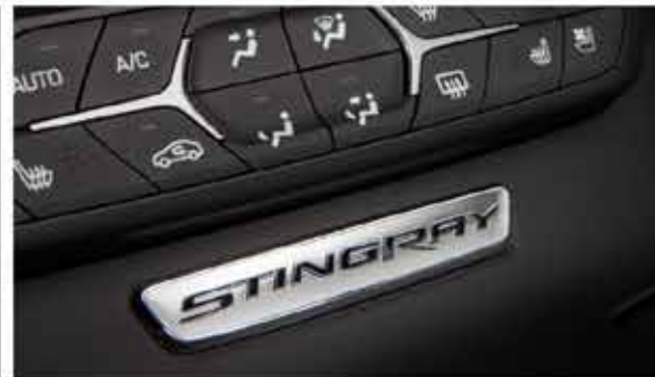
Chrome Interior Trim Badge with Stingray Lettering (5YN)