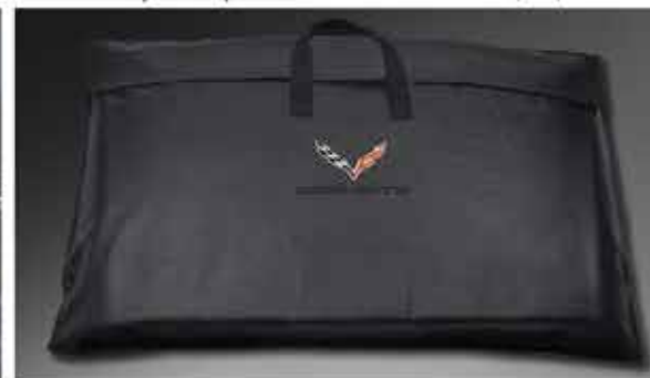
Roof Panel Stowage Bag with Corvette Logo in Black (SC7)